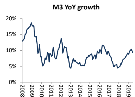
Figure 1: Money supply M3 (y/y growth)

On Thursday Poland's manufacturing PMI for July will be released. We expect manufacturing PMI to decline to 48.1 in July from 48.4 in June.