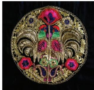
Culture Translated, 2012, Size 12 x 12", zardozi style embroidery, executed during the residency in Mumbai.

Alicja has shown her work in many high-profile exhibitions and venues such as the Barbican and the ICA in London, Kunst Raum Riehen Switzerland, The 54th Venice Biennale, and the Photographer's Gallery in London. Her current project 'Culture Translated' is a cross-cultural dialogue between the traditional forms of folk art and craft from different countries around the world. alicjadobrucka.com